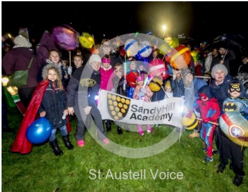
St Austell Torchlight Carnival November 2016

A big thank you to everyone who attended the Torchlight Carnival on Saturday. We were overwhelmed by the amount of people who braved the awful weather to show their support and to fully embrace our superhero theme. The amount of time and effort that everyone had invested to make it such a special occasion, and to show support for Sandy Hill, was just amazing and as a result we looked outstanding!