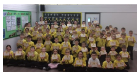
Recipients of attendance certificates.

As the Spring term comes to an end, we have still managed to fit plenty of activities into our final week at school. We've had a demonstration of drumming in assembly, girls' football tournaments, a Rock Steady concert for parents, baking, a multi-school performance at Eden, an Easter bonnet parade plus a celebration assembly to end the week.