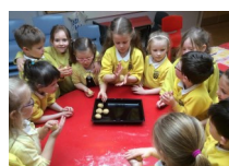
Year 1 Baking Easter Cookies.