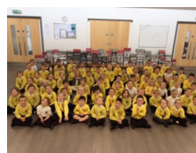
KS1 Tudor Buildings Construction