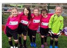
Girls' Football Tournament - Callywith