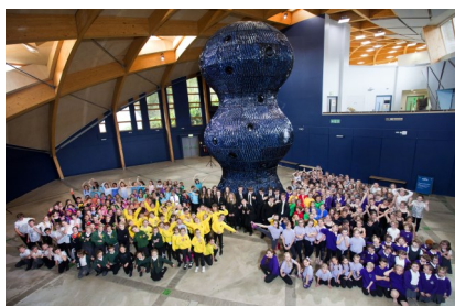
Year 4 & 5 perform at the Eden Project - 'Invisible Worlds'