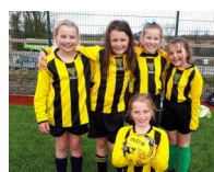
Girls' Football Tournament - Callywith