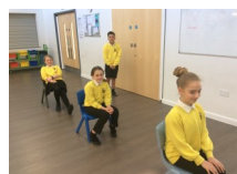
'Life Skills' Assembly - creating a good impression.