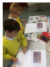
Year 5 Mayan frescoes