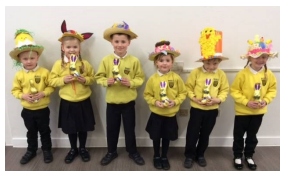
KS1 Easter Bonnet Winners.

We hope you all have a fantastic Easter holiday and look forward to welcoming you back for the Summer term (Tuesday 23rd April).