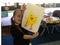
Nursery - Easter Art

As the Spring term comes to an end, we have still managed to fit plenty of activities into our final week at school. We've had a demonstration of drumming in assembly, girls' football tournaments, a Rock Steady concert for parents, baking, a multi-school performance at Eden, an Easter bonnet parade plus a celebration assembly to end the week.