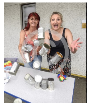
Daily Mail Online Summer Fayre July 2016